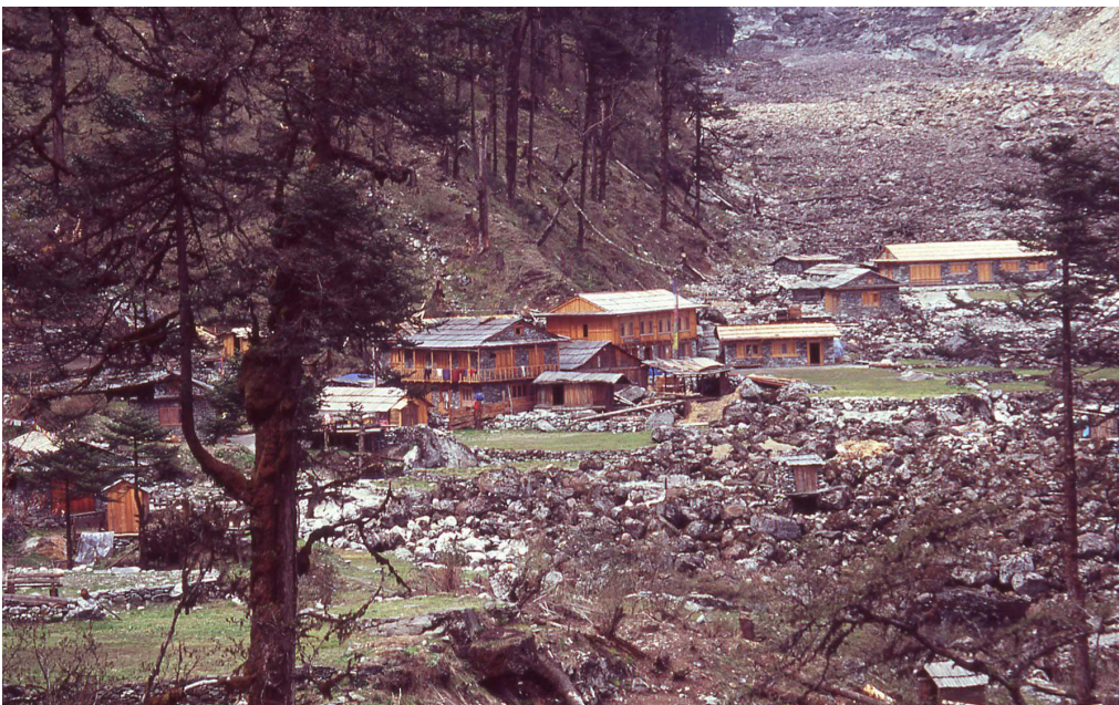
Figure 4 . Kothe village (4236 m) in 2007. Every structure is either a lodge or other tourist-related feature that did not exist when visited by Cox in 1995.

A new national park Sector Office was built in Khote in 2010 that is expected to improve visitor data collection and conservation awareness within the near future. Visitor numbers will most likely grow in the coming years because of the (a) cessation of hostilities and rapid return of trekking tourism to Nepal, (b) desire of many tourists to see a region more remote and wild than Sagarmatha National Park, (c) growing popularity of both Mera Peak and the Hinku-Hongu-Amphu Laptsa pass circuit, and (d) continued growth of the adventure tourism trade,