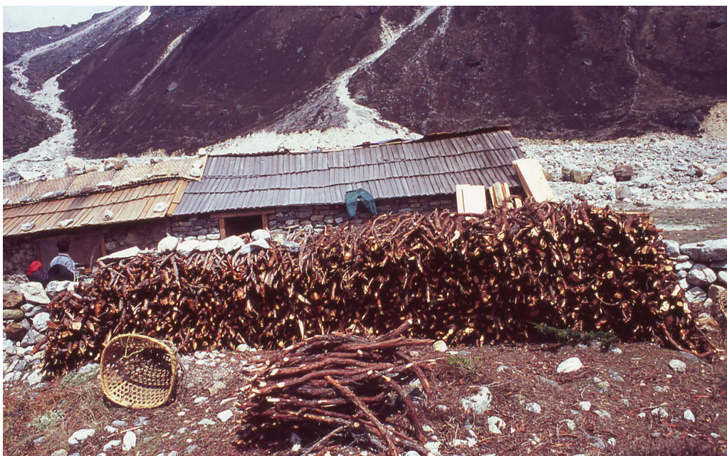
Figure 10. Stockpiles of shrub juniper outside of a lodge in Tagnag in 2007.