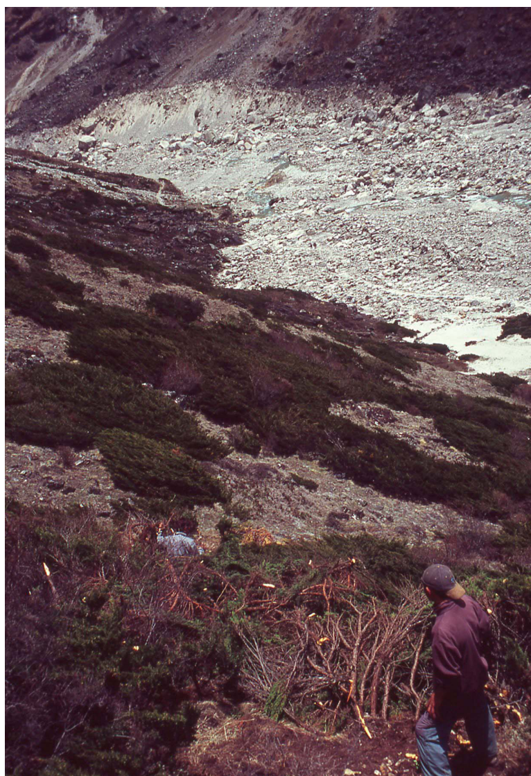
Figure 8. Active shrub juniper harvesting near the Duk Pho Gompa, south of Tagnag.