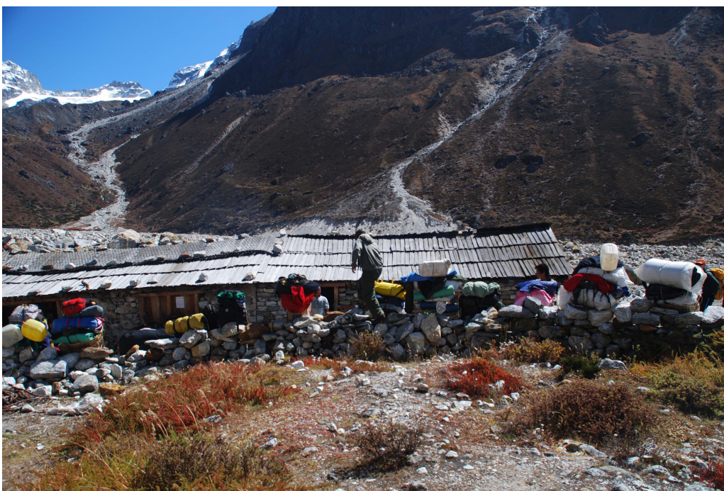
Figure 11. Following the formation of the Mera Alpine Conservation Group in 2007, the burning of shrub juniper and dwarf rhododendron species was almost totally eliminated, as can be seen in the 2009 photograph above.